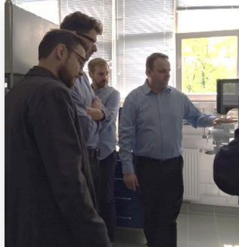
All partners gathered at INOE-ICIA - Cluj-Napoca, Romania, 21 st of May 2019.